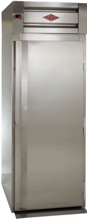
RIR-30-SS-15-H 30" Wide, One Narrow Door, S/S Exterior and Interior