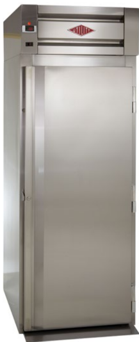
RIHC-30-SS-1S-L 30" Wide, Stainless Steel (shown with optional 12" high top-mount)