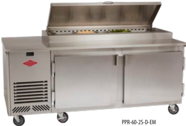
PPR-60-2S-D-EM 78" overall width, 2 doors, self-contained