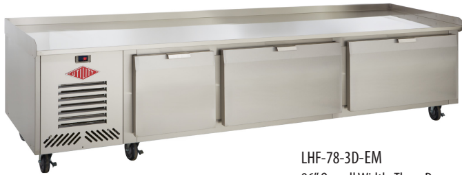
LHF-78-3D-EM 96" Overall Width, Three Drawers (shown with optional stainless steel flat top)