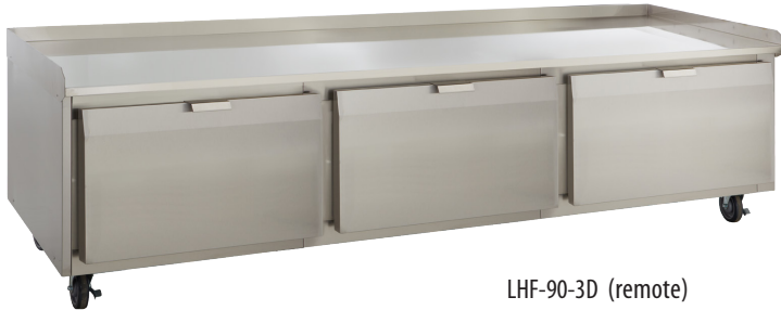
LHF-90-3D (remote) 90" Overall Width, Three Drawers (shown with optional stainless steel equipment top)