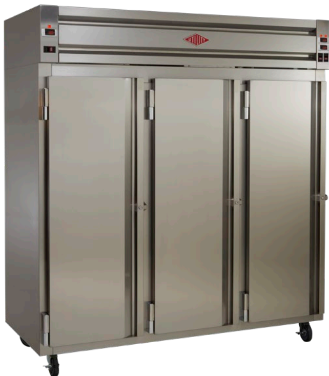
HC-90-SS-3S-D 90" Wide, Stainless Steel Exterior and Interior (shown with optional 12" high top-mount)