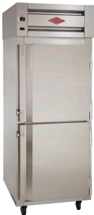
HC-30-SS-2S-D 30" Wide, Stainless Steel Exterior and Interior, half height doors (shown with optional 12" high top-mount)