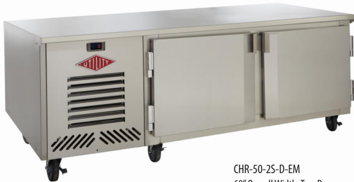
CHR-50-2S-D-EM 68" Overall Width, Two Doors (shown with optional stainless steel flat top)