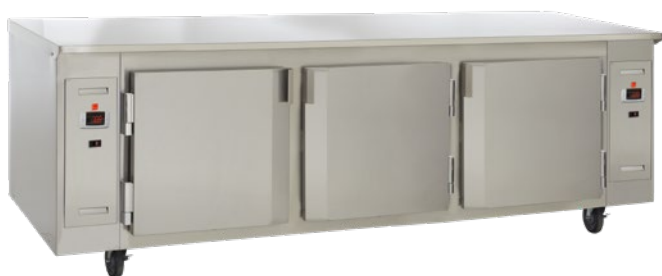
CHHC-90-3S-D 102" Wide, S/S Exterior and Interior