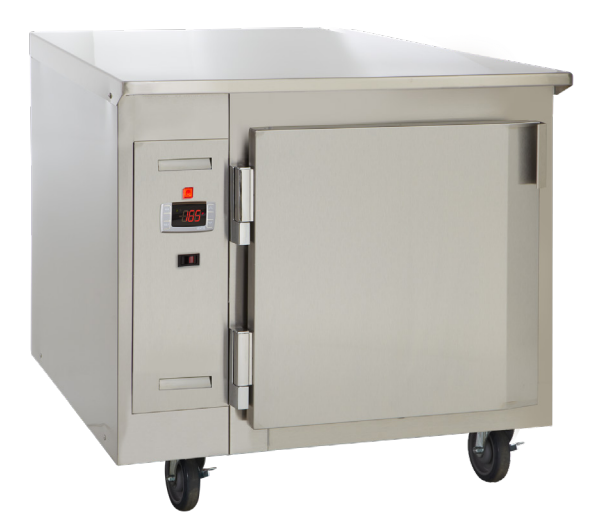
CHHC-25-1S-D 31"Wide, S/S Exterior and Interior