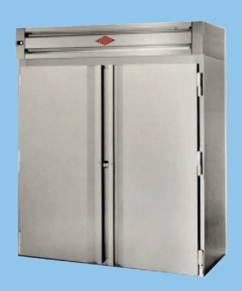
RIR and RIF Series Roll-In and Roll-Thru Refrigerators and Freezers