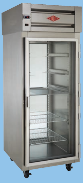
R Series and F Series Reach-In and Pass-Thru Refrigerators and Freezers