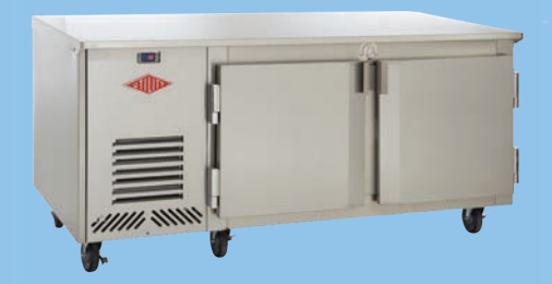
CHR Series and CHF Series Counter High Refrigerators and Freezers (also available as Pass-Thru)