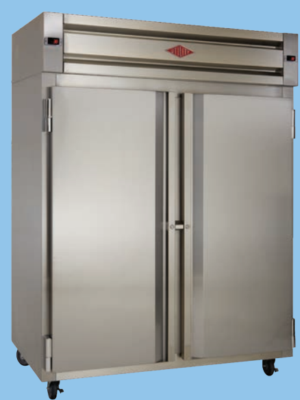
RF Series Reach-In and Pass-Thru Dual Temp Refrigerator/Freezer Combos