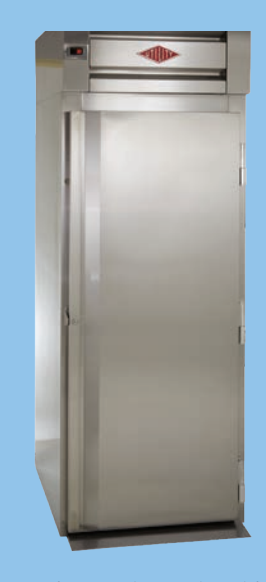
HC Series Hot Food Cabinets