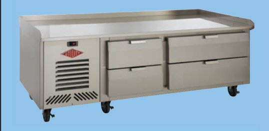
LHR Series and LHF Series Low Height Refrigerators and Freezers