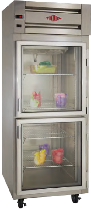
Reach-In Display Refrigerator with Half Height Doors

We focus on solutions... solutions that provide better value and savings. Since its founding, Utility has strived to meet the needs of the end user. Whether it's a modification of one of our standard models or a "build-from-scratch" design, each and every unit is built to the same high standard. Attention to detail is standard operating procedure. With Utility you can be certain your investment will pay dividends for years to come, because at the end of the day there is no substitute for reliability.