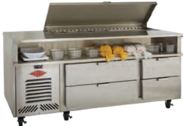
Plate Shelf Refrigerator

OUTSTANDING SUPPORT...INNOVATIVE SOLUTIONS