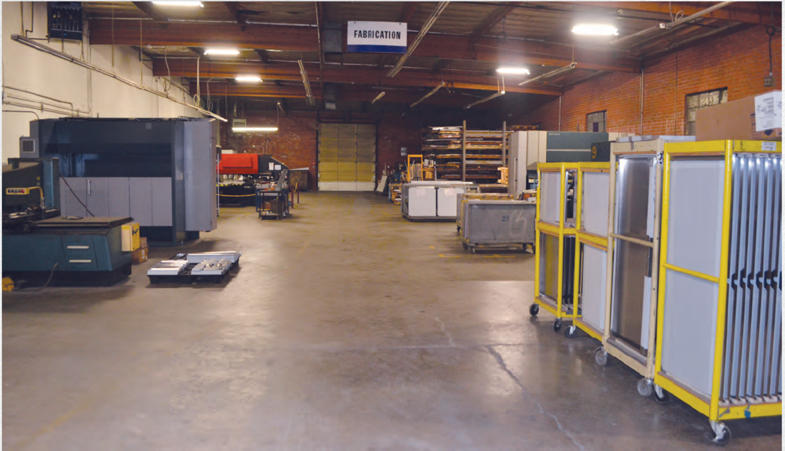
Reach-In Refrigerators and Freezers • Roll-In Refrigerators and Freezers • Counter High Refrigerators and Freezers Low Height Refrigerators and Freezers • Hot Food Cabinets • Wine Refrigerators