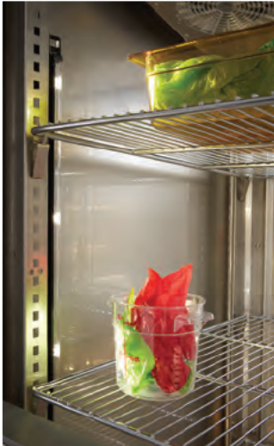
High Intensity LED Lighting