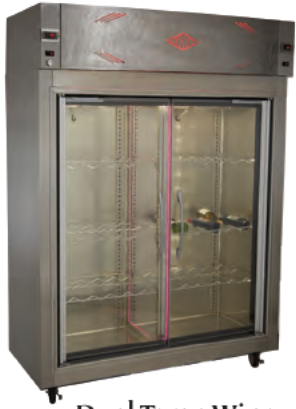
Dual Temp Wine Refrigerator

At Utility, pride manifests itself in many ways. There's the pride we take in the unique service we offer and the dedication and professionalism of our people. There's the pride we take in listening to your needs and then directing our efforts to satisfy those needs. Then, there is the pride we take in our ability to offer innovative products, few, if any, of our competitors offer... products like our pass-thru undercounter units, double depth roll-in/roll-thru models and wine refrigerators, to name a few. Lastly there is the pride and confidence we have in our equipment. Utility is the only refrigeration manufacturer to offer a standard 5 year parts/5 year compressor warranty on all of our units. To sum it up, with Utility you get more for your money and we take immense pride in that fact.